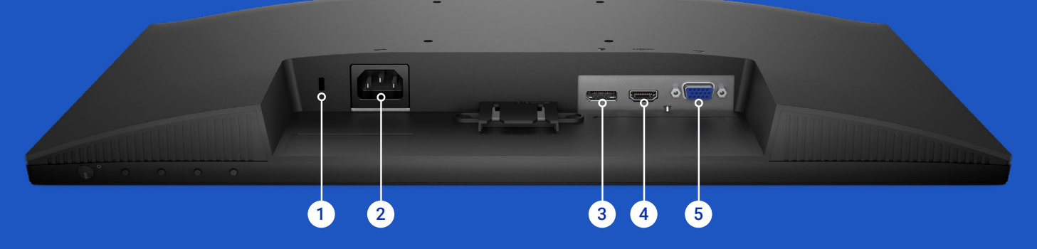
Dell Pro 22 Adjustable Stand Monitor