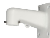
DH-PFB305W Wall Mount Bracket